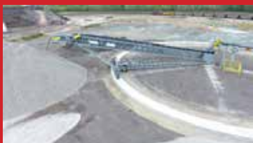
MASABA 42" x 170' Magnum Stacker rated at 1500 TPH