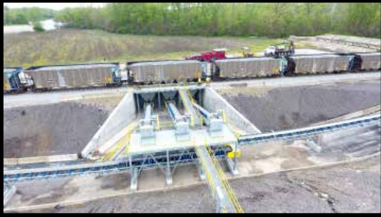
1500 TPH Railcar Unloading Facility

Design | Fabricate | Install | Support | Service