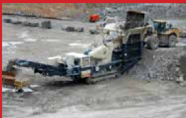
Metso Primary Crusher LT130E Track Jaw at 800 TPH