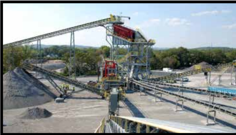
1000 TPH Tower and Deister 10 x 24 Quad Deck with McLanahan Ultra Sand Processing Plant

Unique solutions for the processing industry Systems BIG and small that WORK and keep on working