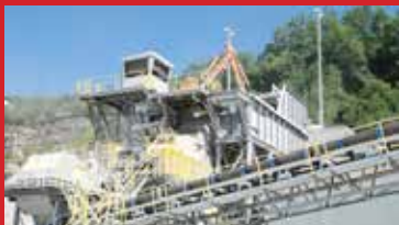
PMI 1300 TPH Primary crusher station with Metso NP1620 and Deister VGF